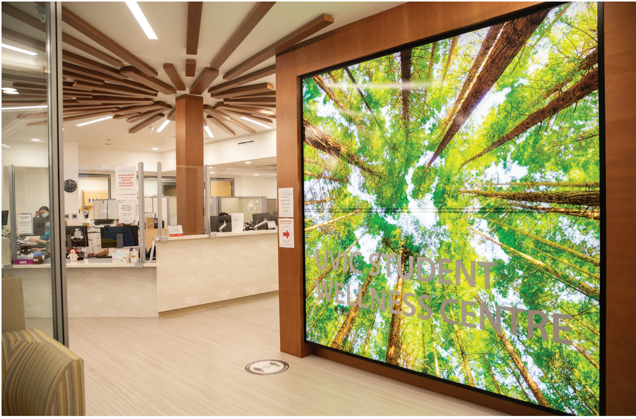
A multidisciplinary team of practitioners work at this centre to provide emotional, physical and spiritual care services