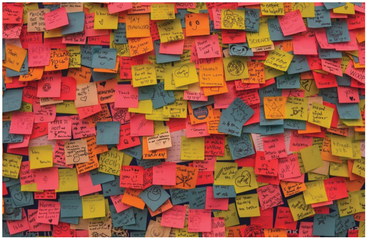
Bulletin boards covered in thank you notes from a grateful, vaccinated public were a common sight at vaccine clinics across our health region

"I realized I don't have much experience in care delivery; just working there for a few weeks helped me see every moving part."