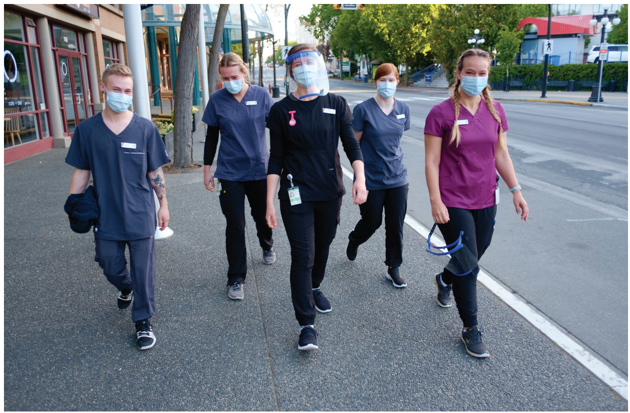
Fourth year Nursing students are on their way to work the early shift at a downtown vax clinic