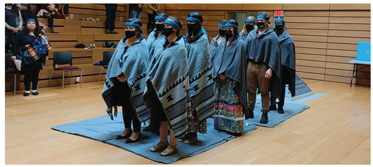
Faculty and students attend Renewal Celebration