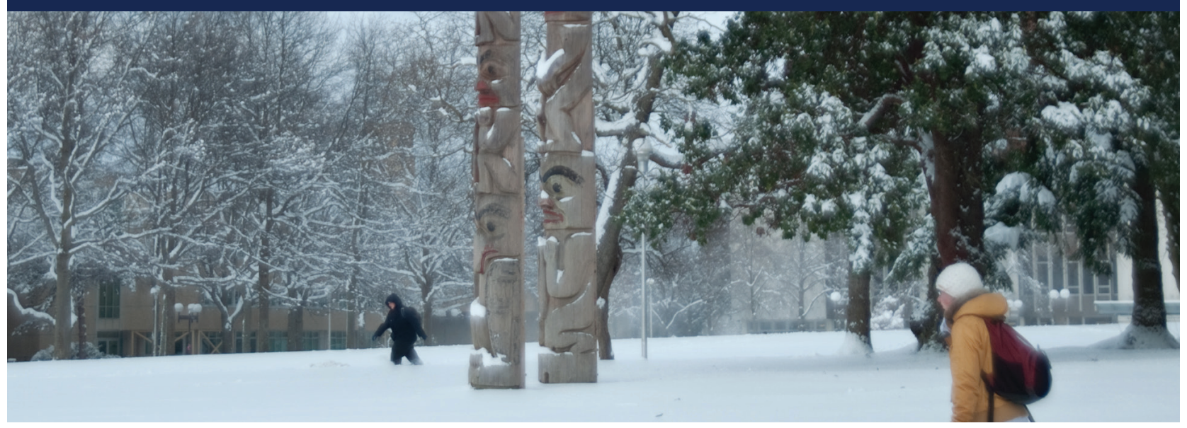
The UVic Quad was once a camas field surrounded by Garry Oak trees